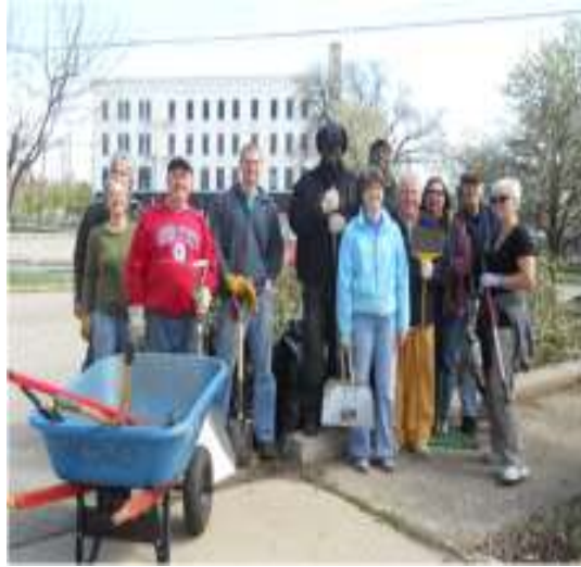
Members of the business community working to keep the business district clean

The ODBA has been busy with spring cleanup activities in the commercial district. We want the Arts District to be welcoming, well-lit, safe and inviting for all our spring and summer activities. This year, we concentrated our cleanup activities on Gates St, between Wayne and Fifth. There were many overgrown shrubs and tree limbs that were blocking much-needed light from the ornamental lighting fixtures that surround the north parking lots and walk areas. Thanks to the participation of the Downtown Dayton Partnership's Ambassadors and a number of other volunteers, we were able to clear approximately 2 tons of debris! And, thanks to the City of Dayton for removing the debris for us. We will be planting annuals in the pots in the District mid-May. The DDP has also started a 'deep clean' of the commercial district, pressure-cleaning the overpass and starting the graffiti-removal process. These activities are